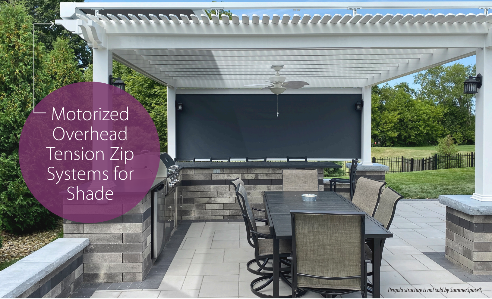
Pergola structure is not sold by SummerSpace ® .

Motorized Overhead Tension Zip Systems for Shade