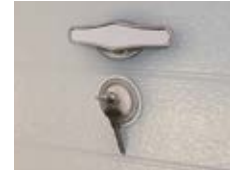
Outside keyed lock